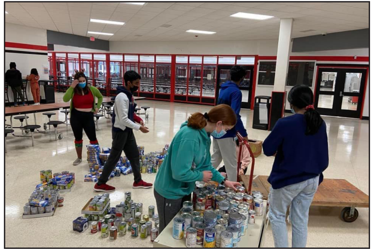
Churchill students organize donations